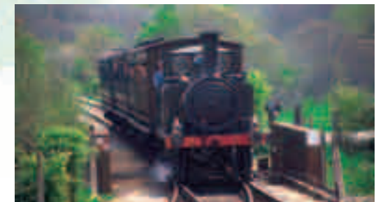
Isle of Wight Steam Railway

The walk can be continued into the centre of Ryde. Turn right over the bridge into Monkton Street. Continue down the hill 800 metres (880 yards) and turn left into East Street. Continue until you reach Dover Street, turn right and cross over the Esplanade to the seafront. Island train and bus stations along with the ferry and hovercraft terminals for the mainland are to the left along the Esplanade.