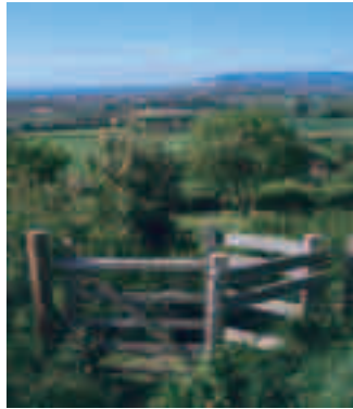
View to Sandown